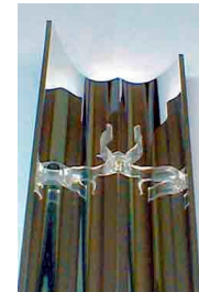
Version Daywing - asymmetric

Special productions are developed without extra costs !