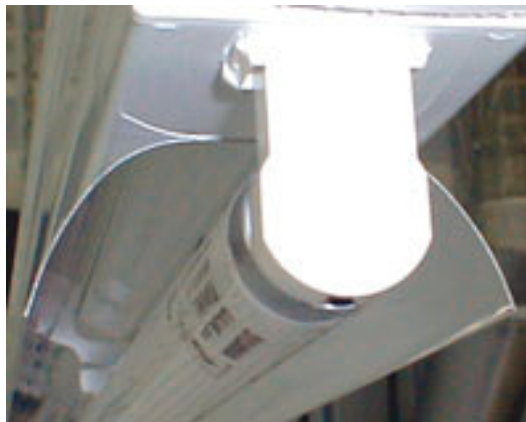
Reflector „DAYSYS® 03“